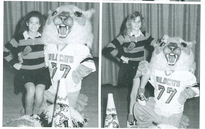
Junior high cheerleaders really built that spirit up.